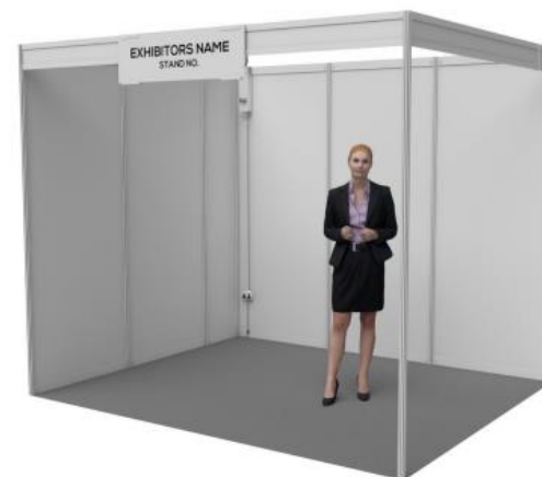
Shell Scheme Stand example

NB – Any additional requirements for your stand, e.g. branding, furniture, TV's, stand builds etc. is at your own cost and can be ordered with our Building Contractor or if you have a Space Only Stand you can commission your own Building Contractor.