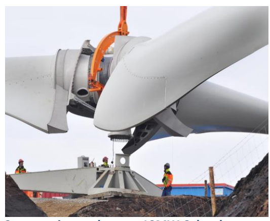
Construction at the new 10MW Caherdowney wind farm operated by Energia Renewables